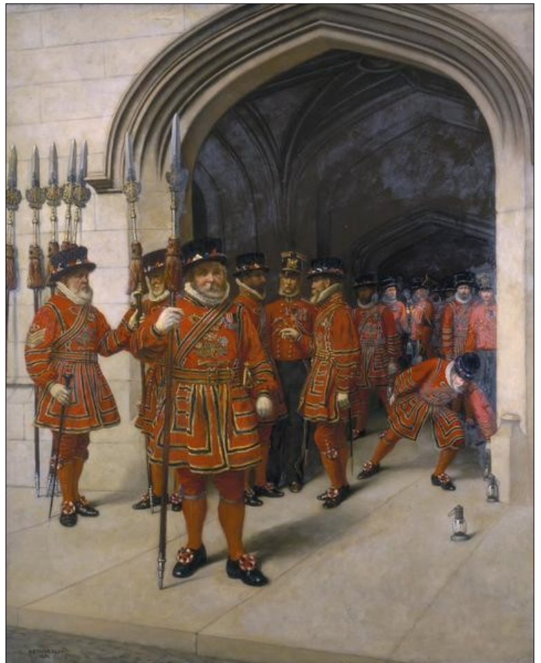
EVERY YEAR SINCE 1605 THE BEEFEATERS CEREMONIALLY SEARCH THE CRYPT OF THE HOUSES OF PARLIAMENT

'THE BLOOD OF JESUS CHRIST, GOD'S SON CLEANSETH US FROM ALL SIN' 1 JOHN 1 V 7