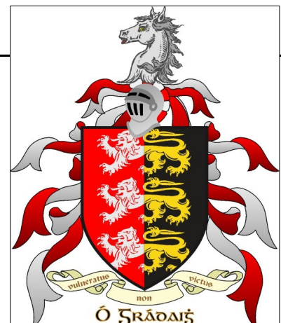
THE O'GRADY COAT OF ARMS