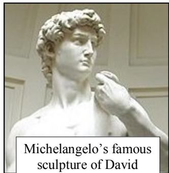
Michelangelo's famous sculpture of David

4. When Michelangelo was painting a p_____ or carving a st_____, he used to carry a l_____ on his head, to stop his sh_____ falling on his work.