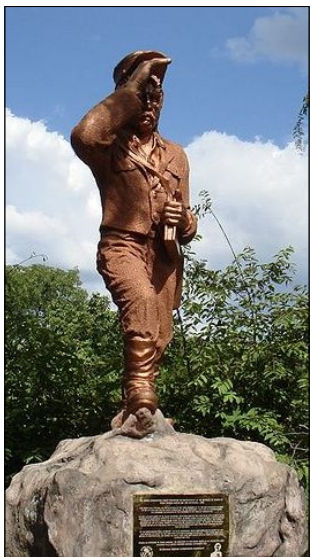
Statue of David Livingstone

7. Now God gave him a new vision. If a ship could be built, and taken in pieces to the lake and then re-assembled, it could sail all around the huge lake and take the gospel message to many thousands of people. Livingstone decided he would pay for the building of such a ship himself.