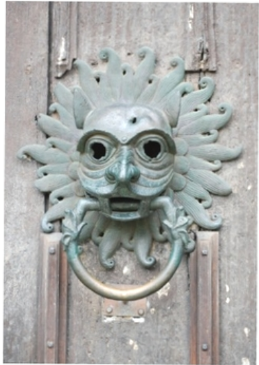
The Sanctuary Knocker

Sanctuary - After the Galilee was built, the north door of the nave became the Cathedral's main entrance.